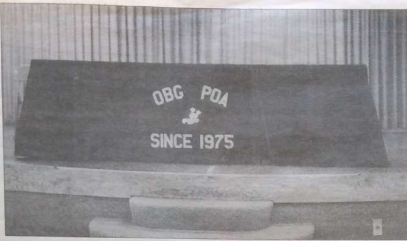
P.O.A. NEW TABLE COVER