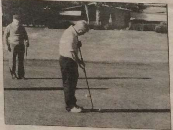
What kind of putter?