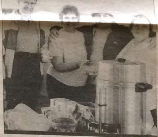
Part of "the crew"