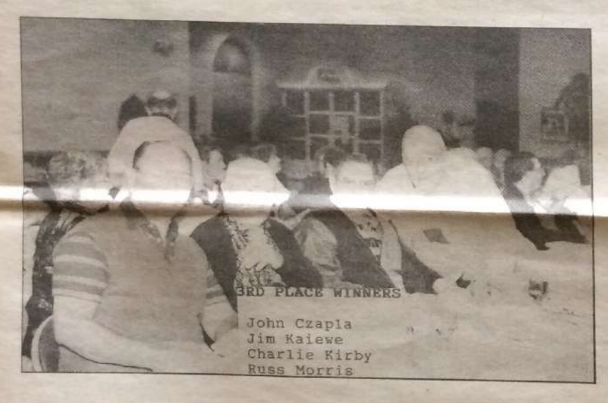
Dining at Hacienda Center