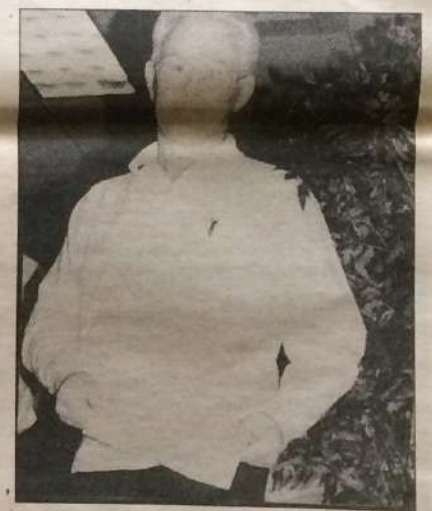
Just a few of the winners